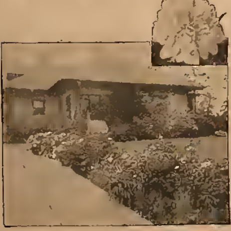
Border of Peonies

Named Sorts or Any Color, 50c each; $4.50 per 10. Mixed or Our Selection, 35c each; $3.00 per 10. XX or Blooming Size as double the list price. SPECIAL —3 Peonies (our selection), for $1.00, postpaid. Special circular on request.